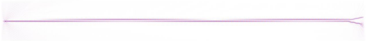
Figure 4 Periodic energy exchange between nanofibers due to evanescent field overlap- simulation