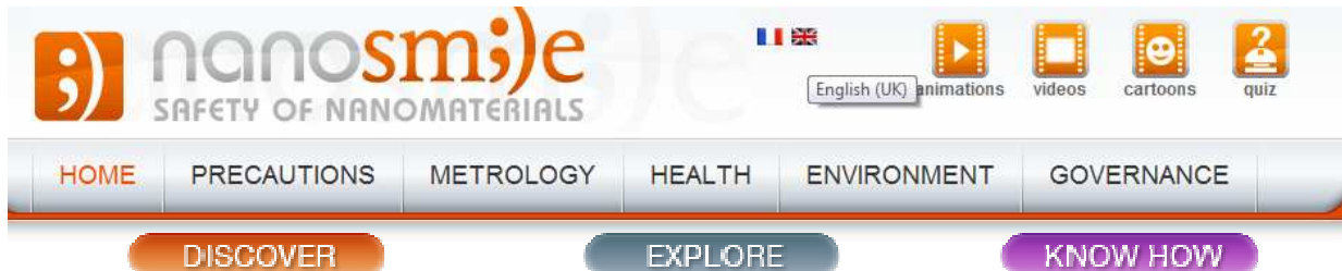
Fig.2 Nanosmile concept http://www.nanosmile.org

This website, initially implemented as an e-learning support available internally at the CEA, has been gradually opened to the public at large and updated in the frame of EU FP7 iNTeg-Risk, NanEX [5], NanoHOUSE [6] and NanoCode [7].